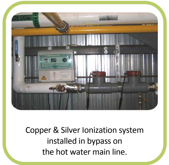
Copper & Silver Ionization system installed in bypass on the hot water main line.